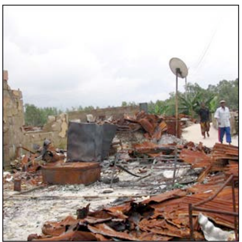
lim Wallace, NPR

In a speech to Governor of Baylesa on 27<sup>th</sup> February 2005, The King of Odioma (Highness Cabri George Omieh, Igoni XXI) made the following assessment of the events: