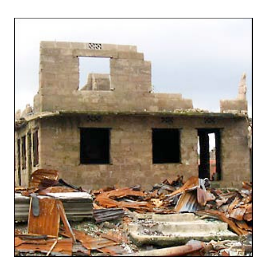
Jim Wallace, NPR

history and in the in the delta cannot be understood outside of the state definition of oil as a national security issue and its desire to ensure that the oil keeps flowing. Thus, after the destruction of Odi, Nigeria's then minister of Defence General Theophilus Danjuma, in the course of addressing the Economic Committee of West African States (ECOWAS) ministerial conference on November 25, 1999 was quite explicit when he said: "This Operation HAKURI II, was initiated with the mandate of protecting lives and property—particularly oil platforms, flow stations, operating rigs terminals and pipelines, refineries and power installations in the Niger Delta" ( The Guardian , Lagos, November 26, 1999).