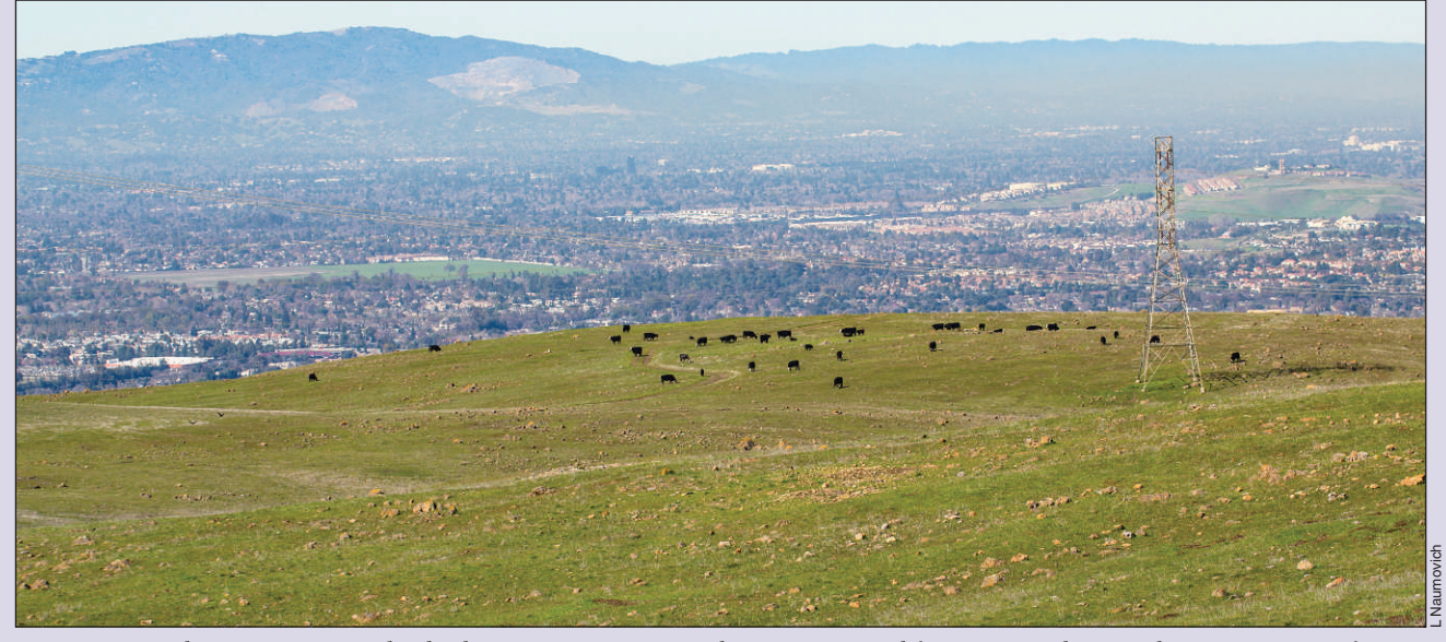
Figure 3. Cattle grazing on rangelands above San Jose, Santa Clara County, California. Note the smog layer – a source of excess nitrogen deposition to surrounding lands – visible above the city.

In response to pressures for land-use change and fragmentation, uncertain public land tenure, and challenges from environmental groups, ranchers in many parts of the US have diversified their operations and organized community-based conservation efforts to resolve conflicts, protect unfragmented rangelands, and restore historical disturbance regimes such as periodic fire (Sayre et al. 2012). The Malpai Borderlands Group in southern Arizona and New Mexico, for example, involves ranchers, scientists, environmentalists, and government agencies committed to restoring fire, reversing shrub encroachment, protecting biodiversity, preventing fragmentation, and supporting local livelihoods in a 325 000-ha area of semiarid rangeland and montane woodland (Sayre 2005). Regulatory problems relating to fire and rare wildlife species are more easily addressed at scales larger than individual ranches. Many rangeland conservation groups, including Malpai, also operate as (or collaborate with) local land trusts, purchasing conservation easements that permanently restrict subdivision and development on private lands. Indeed, there is some evidence that the area of western lands protected by easements in recent decades exceeds the area converted to suburban and exurban land uses.