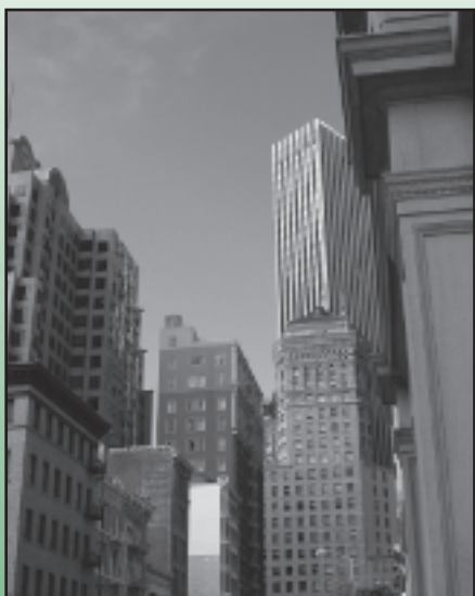
In downtown San Francisco buildings from across the ages are juxtaposed. The modern city is the sixth major iteration of urbanism on the San Francisco peninsula.