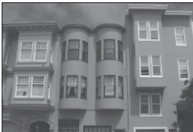
These apartments built on Nob Hill following the 1906 earthquake helped create yet another identity for San Francisco.

The Edwardian city was rounded out in the 1920s with an Opera House and Civic Center, bold new skyscrapers downtown, and a brand new waterfront walled off from the city. Then came the stagnation of the Great Depression and the immense building program of the New Deal, which gave the city dozens of schools, an aquatic park and a wealth of social realist murals (as at Coit Tower). But World War II turned everything on its head again. San Francisco prospered from the Pacific war, and its leading capitalists were poised to remake the city as a postwar gateway to the American century. Urban renewal was to be the vanguard of an expanded corporate downtown with feeder lines of freeways and BART (Bay Area Rapid Transit) to bring in business commuters from the burgeoning suburbs. The Yerba Buena project broke across the barrier of Market Street to take out the Third Street skid row, Embarcadero Center replaced the wholesale produce market, and the Western Addition's thousands of