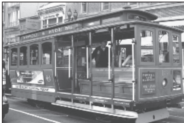
Unique physical and cultural geographies intersect in downtown San Francisco.

exception, notice will be given in the AAG Newsletter , along with an explanation of the reason for the exception. ■